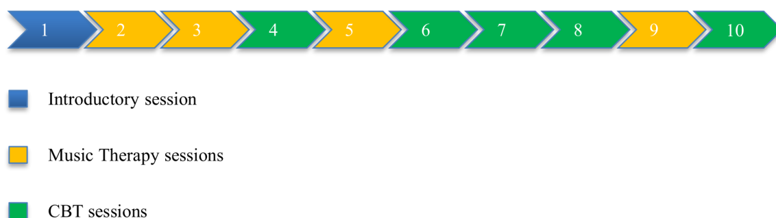
Figure 2 Graphical depiction of the 10 therapy sessions in the mental training programme. CBT, cognitive-behavioural therapy.

Normally, neither general practitioners nor paediatricians in Norway schedule appointment with postinfectious CF patients unless they have strongly reduced physical function. Thus, 'care as usual' implies that the relevant individuals would not receive any healthcare for