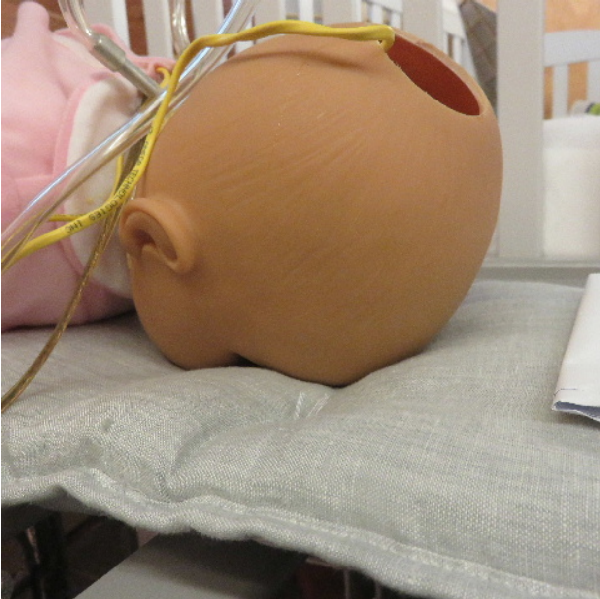
Supplementary Figure 4 – Test setup for the effect of variation in applied force between face and sample.