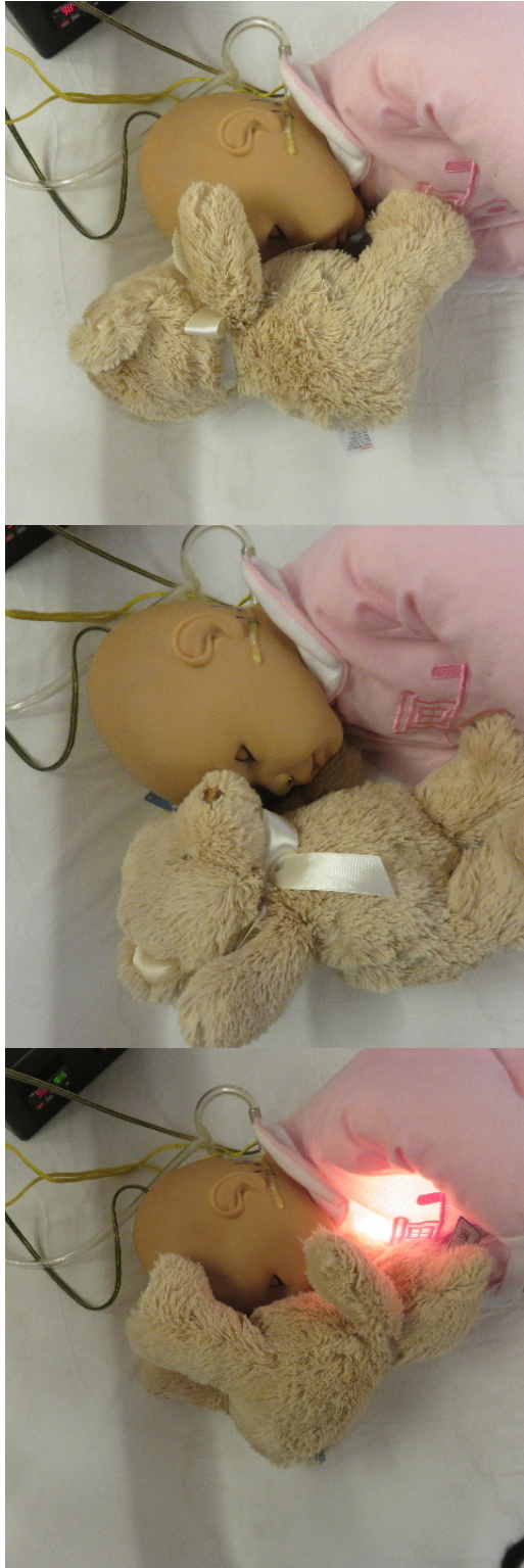
Supplementary Figure 3 - Test setup with stuffed animal on the nose (top), proximal to the nose (middle), on the face (bottom).