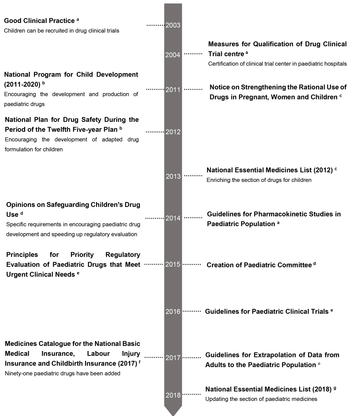
Figure 2 Policies on paediatric drug trials in China. (a) State Food and Drug Administration, SFDA (now namely National Medical Products Administration, NMPA); (b) The State Council; (c) Ministry of Health (now namely National Health Commission); (d) National Health and Family Planning Commission, NHFPC (now namely National Health Commission); (e) China Food and Drug Administration, CFDA (now namely NMPA); (f) Ministry of Human Resources and Social Security; (g) National Health Commission.